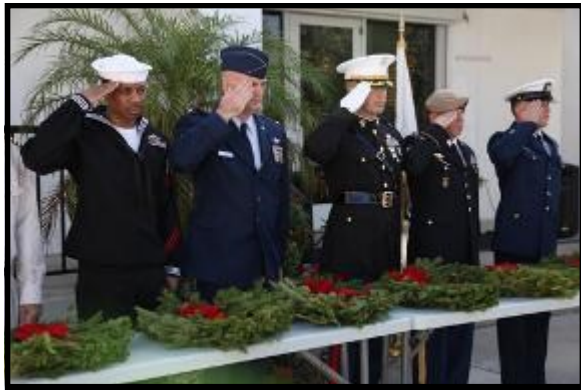
Members of the United States military salute during the Wreaths Over the Water ceremony at Coast Guard Station Lake Worth Inlet, in Riviera Beach Fla., Saturday, Dec. 15, 2012.

The annual ceremony began at the station in 2007 as a memorial to service members who have died at sea, and includes placing seven wreaths in the water to honor the five military services, the Merchant Marines, and prisoners of war and those missing in action.