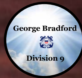
George Bradford Division 9

But such a tide as moving seems asleep, Too full for sound and foam, When that which drew from out the boundless deep Turns again home.