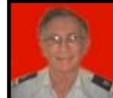
Arnold Greenhouse 3