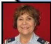
Allegria Bouquet 8