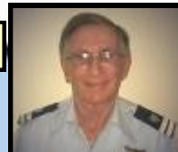
Arnold Greenhouse 3