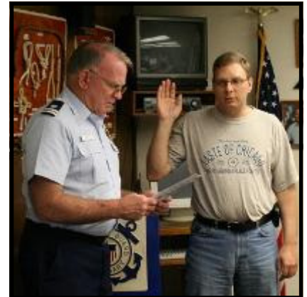
New members are the key to the growth of a unit. Flotilla 49 swearing in of new members.