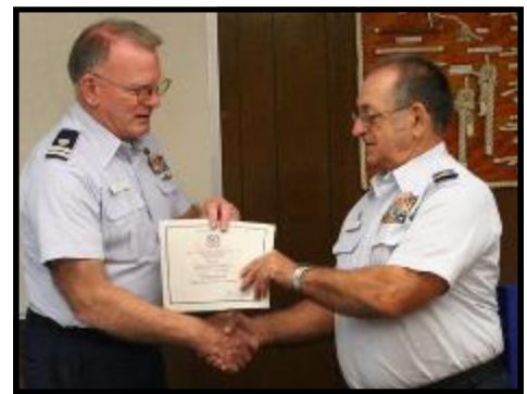
As Always, awards for outstanding service presented to members with dedication to the CG/Aux.