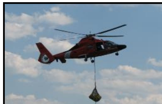
USCG Helo Preparing to Deploy Boom