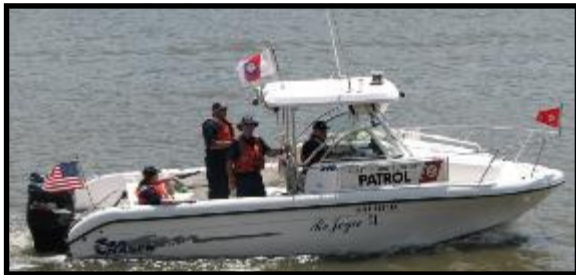
Auxiliary Vessel from 10-01

Lt. Cmdr. Lynn, who is the AUXLO for Division 10, asked the three flotillas in the immediate area to provide 4 boats and crews for the demonstration as well as 4 communicators. The boats and crews provided security north and south of the demonstration area.