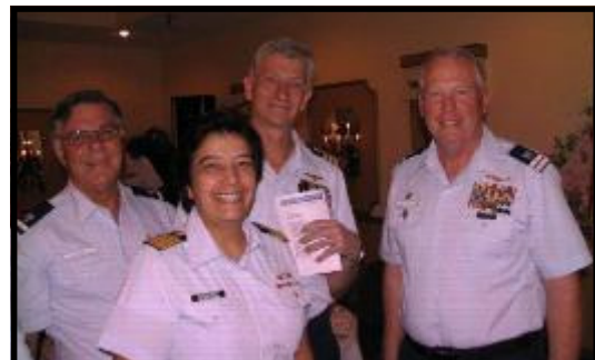
Division 11 Annual Banquet