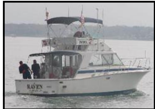
The "Raven" on Patrol

Activities in Division 11 include award banquets, annual picnics at Station Sand Key, Division night operations, helicopter operations, Operational Excellence training exercises, and safety patrols.