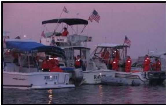
Night Patrol Raft-up