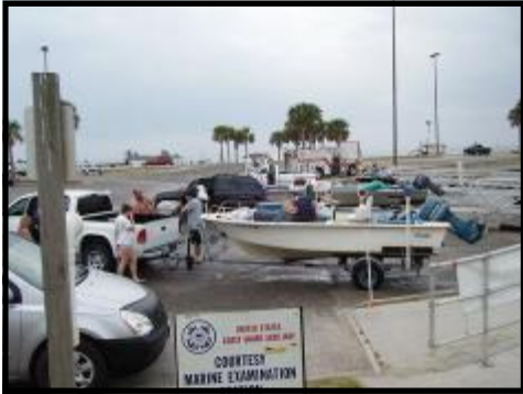
Vessel Exam stations was set up at Parrish Park in Titusville during the opening weekend of Safe Boating Week, and again over the Memorial Day Holidays