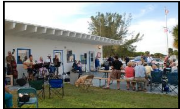
Families, friends, and visitors are invited to share a good time when we get together.