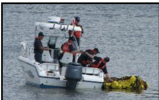
Auxiliary 10-11 Vessel at the Boom