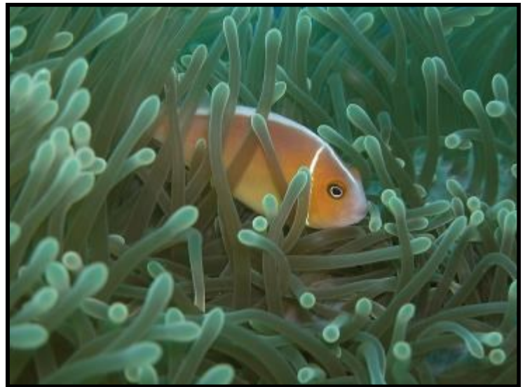
Diving The Colorful Great Barrier Reef