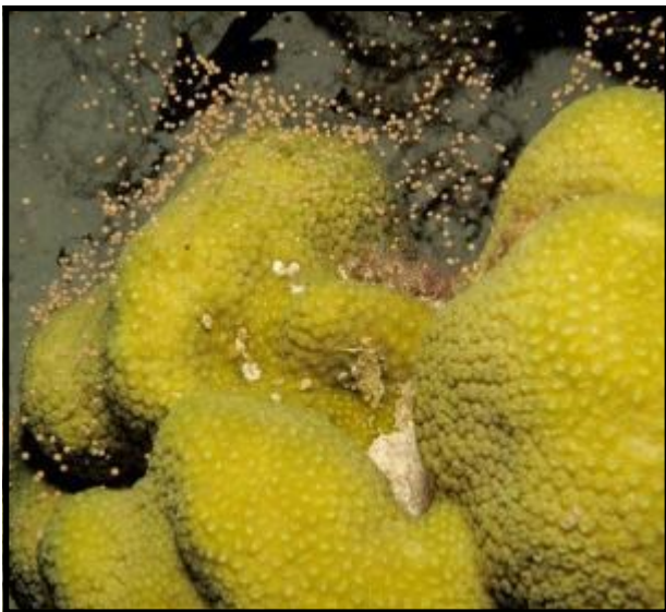
Coral Spawning by Moonlight by Ralphle Williams

Do your part. Learn about coral reefs and educate the public as you do vessel examinations, conduct safe boating classes or distribute information doing marine visitations. Hopefully, 40 years from now the condition of coral reef will be improving.