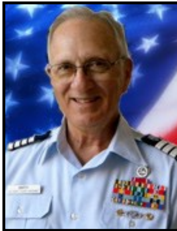
Chief of Staff