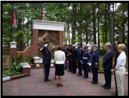
Wreath presentation at 911 Ceremony