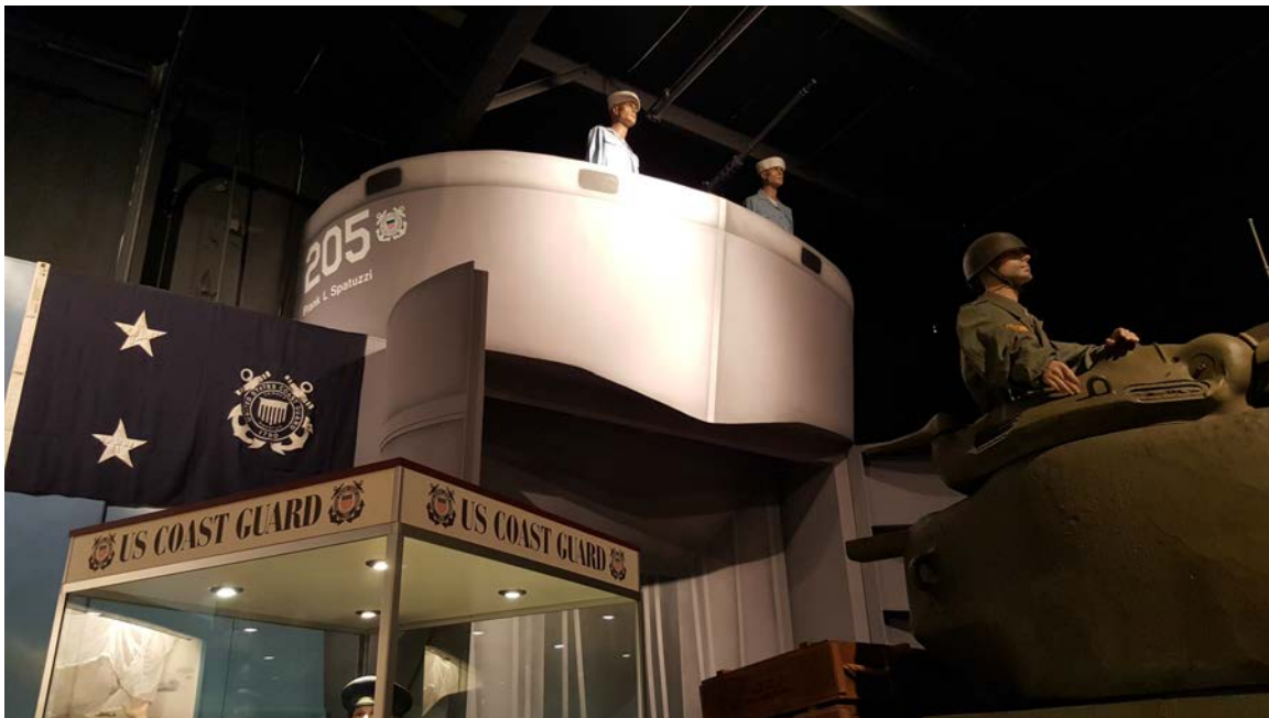
A USCG landing craft unloading armored vehicles during the Normandy Invasion.