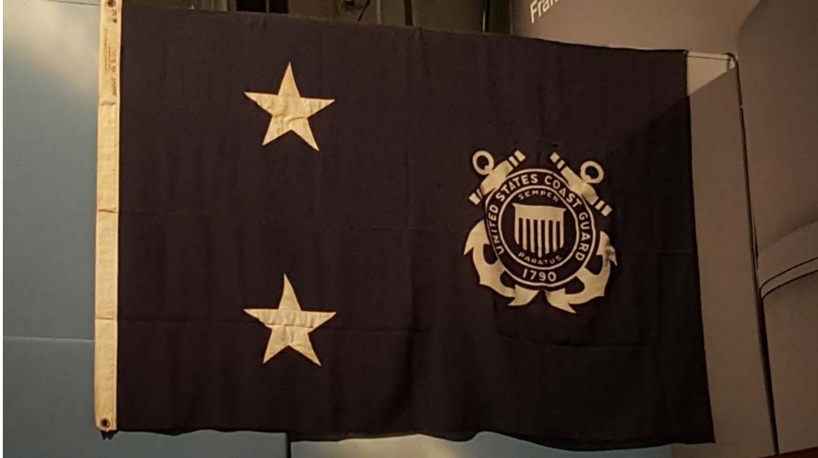
One of a number of USCG artifacts that were on display at the Armed Forces History Museum in Largo, Florida.