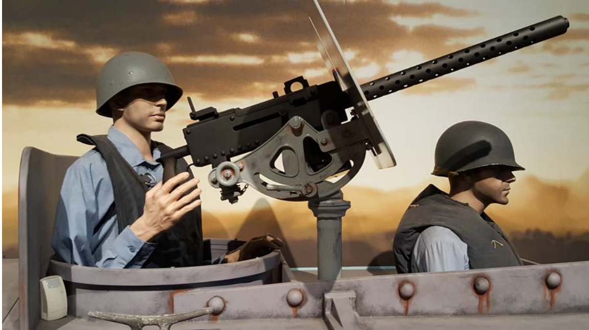
Amongst the displays are Coast Guardsmen providing support in transporting troops from the ships to shore during World War Two.