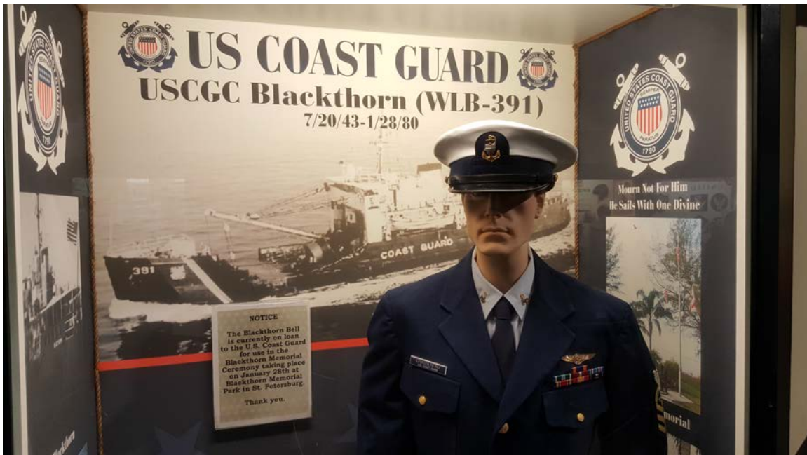
There is one display case dedicated to the memory of the USCGC Blackthorn.