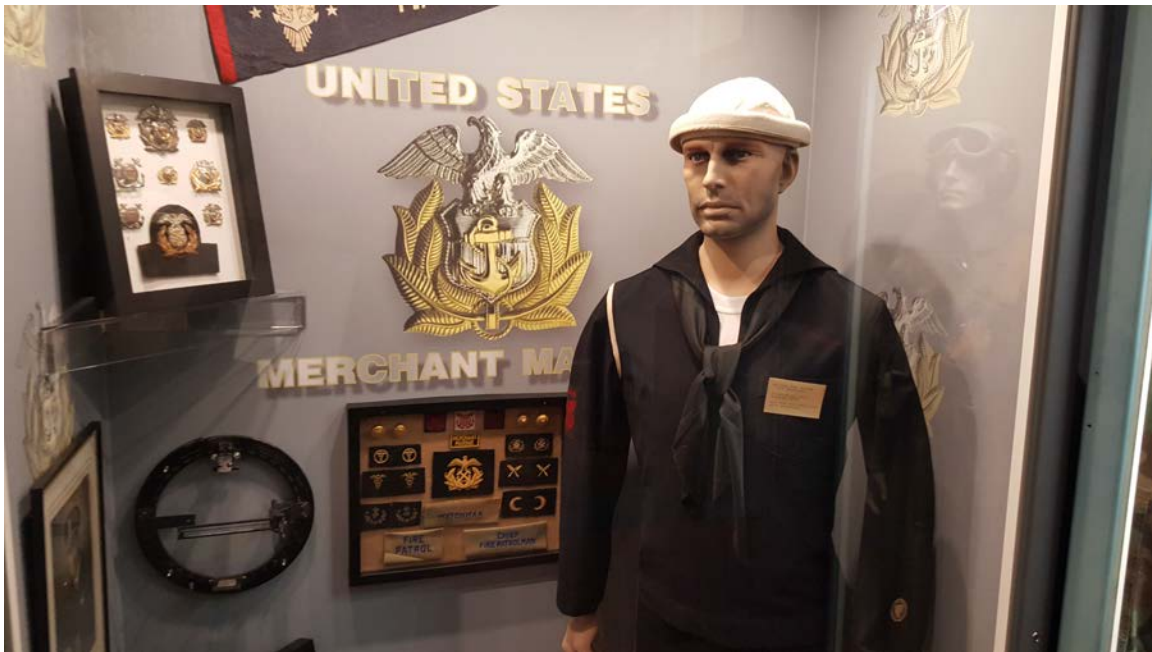
In addition the Merchant Marines were represented in the museum. Prior to World War Two and afterwards the USCG had a role in training and licensing merchant seamen.