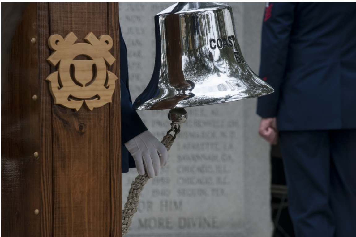
Every 28 January the ship's bell is taken from the Armed Forces History Museum to the Blackthorn Memorial near the Skyway Bridge. The bell is used to commemorate the names of those Coast Guardsmen that lost their lives on the fateful night. Since the museum's closing the fate of the bell has not been determined at the time of writing.